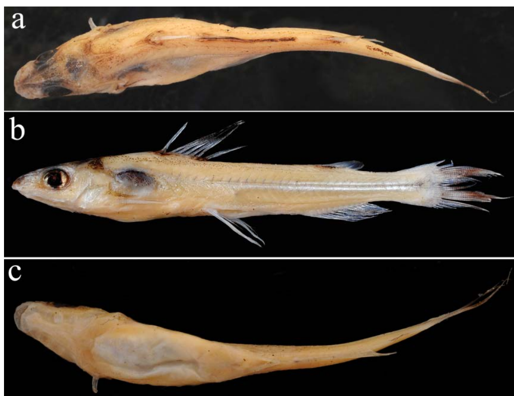
Figure 1(a, b, c): Batasio spilurus , RGUMF 318, 54.1 mm SL. a) Dorsal b) Lateral c) Ventral views.

Batasio spilurus differs from all known congeners by its short adipose-fin base (10.0-12.8% vs. 14.5-33.3% SL) and slender caudal peduncle (5.7-6.6% SL vs. 6.7-11.8% SL). It further differs from the congeners occurring in the Brahmaputra drainage, except B. tengana (Hamilton) in having a slender body 11.9-14.1% SL (vs. 15.8-23.9% SL). Batasio spilurus can be easily differentiated from B. tengana in having a wider head (14.7-16.5% vs. 12.5-14.5% HL), the presence of a distinct greyish triangular spot at the base of the caudal fin (vs. spot very diffuse or absent), and a more