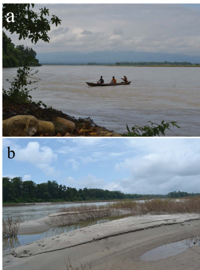
Figure 2 (a, b): Collection site of Batasio spirulus in Siang River at Pasighat, Arunachal Pradesh: a) Main river b) Portion of river in southern bank.

Ng (2006) re-described and clarified the identity of Batasio tengana based on the specimens collected from the Tista River and original drawing of Hamilton (1822), and he also pointed out that those specimens assigned to B. tengana by earlier workers viz. Hora and Law (1941), Jayaram (1977), and Ng and Kottelat (2001) are misidentifications of Batasio fasciolatus Ng. Hitherto, four species of Batasio are recorded from Arunachal Pradesh viz. B. fasciolatus from the Panye River (Subansiri basin) (Bagra et al., 2009), Batasio merianiensis (Chaudhuri, 1913) from Sille River, a tributary of Siang River in East Siang district (Tamang and Sinha, 2014), Batasio tengana (Hamilton, 1822) from Noadhing River (Nath and Dey, 2000) and Batasio batasio (Hamilton, 1822) by Sen (2000) without mentioning the place of its occurrence. Present investigators also encountered B. batasio from the Siang, Subanshri, and Dibang Rivers of the state. Further, the present study recorded Batasio spirulus , a fifth species, from the Siang River of Arunachal Pradesh. It is observed that the specimens of B. spirulus slightly differ from the original description in the length of predorsal 36.1-38.1% SL (vs. 40.5-42.0% SL), dorsal-fin base 13.8-15.3 (vs. 15.5-15.8), adipose fin base 10.0% SL (vs. 12.6-12.8), post adipose distance 19.5- 20.3 (vs. 18.3-19.0), depth of