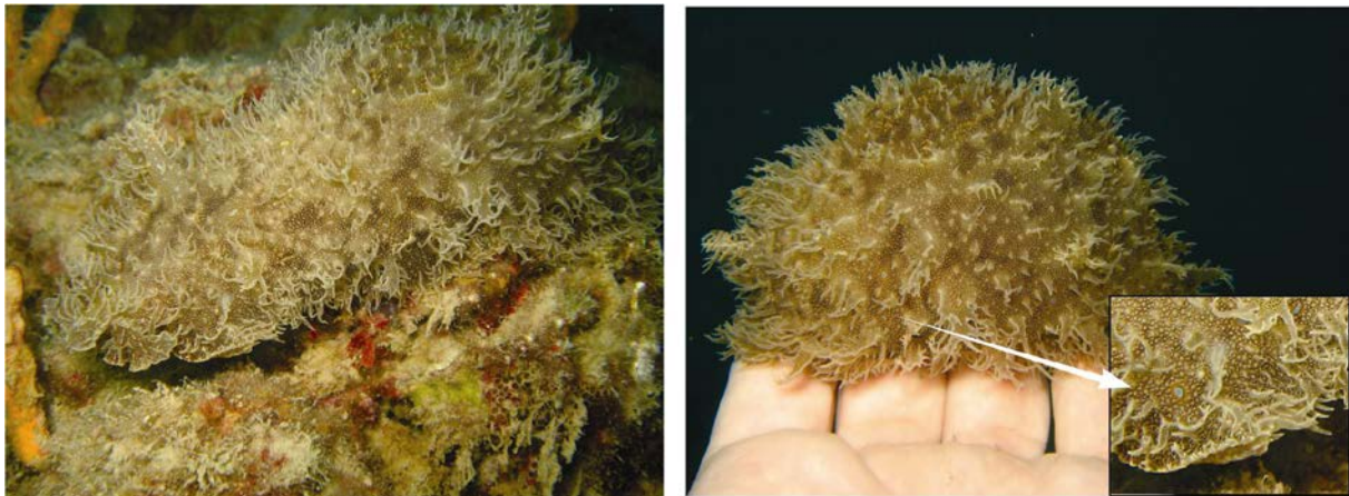
Figure 1. Bursatella leachii De Blainville, 1817

Short description: Body 8 cm. Two pair of tentacles on the broad and short head. Short and triangular tail with white bands. Body covers different shadows of brown color. Blue colored eyespots and white branched papillae scattered over the brown body.